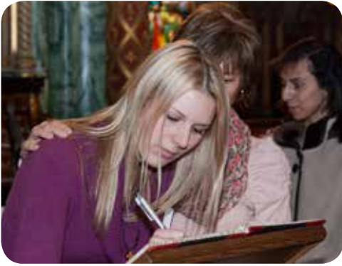
Top: Rite of Election; middle: Jubilarian Dinner; bottom: Chrism Mass