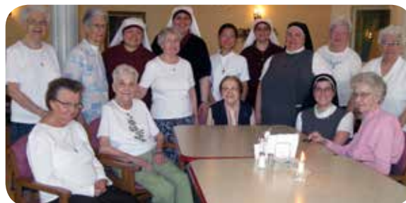
Fraternal meeting: Sisters of l'Institut Jeanne d'Arc, Franciscan Sisters of Halifax and the Servants of the Cross