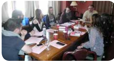
Catholic Perspectives formation last February

Catholic Perspectives has helped me learn more about the Church, strengthen my faith, prepare me to do a couple of interviews with Carleton University journalism students, and has given me useful skills in my volunteer ministry with the Ottawa Catholic Challenge Movement.