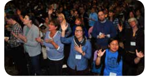
Praise and worship during the NES