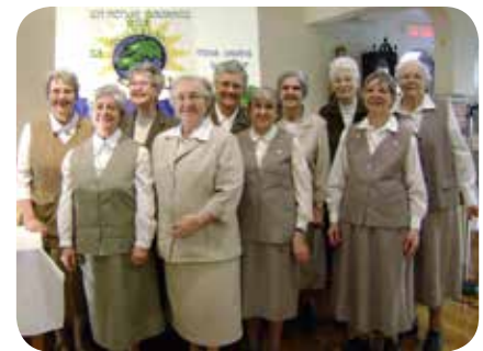
Photo taken at the February 22, 2014 meeting

Today, the Sisters of Charity of Ottawa and their Associates are of various nationalities. They continue to witness to the spirituality, mission, and charism of compassion that Élisabeth Bruyère entrusted to them.