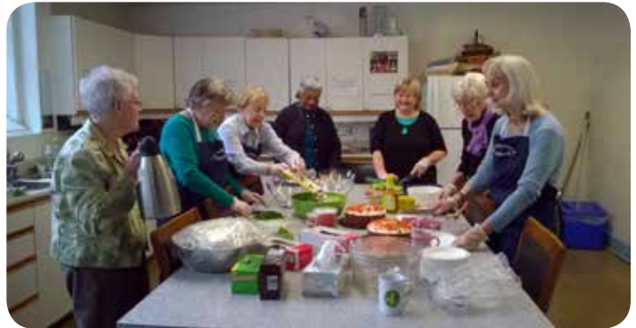
Seniors serving neighbourhood seniors at Saint Theresa's parish

If there is a need for this type of ministry in your parish or if you would like to help us explore what we can do for seniors, please contact me by email at: pmarsdendole@archottawa.ca .