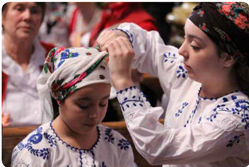
Two sisters at the Homelands Mass on January 25

Two main concerns were brought to our attention by our parishioners. First, couples are required to take a marriage preparation course,