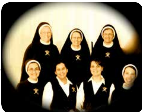
The Queenship of Mary

with the heart of Mary that we will be answering the call of the new evangelization. We are presently in the process of acquiring land on the outskirts of Ottawa, where we plan to build our motherhouse and a future chapel and quiet haven dedicated to our Blessed Mother. In the peace and beauty of nature and through dedicated perpetual Adoration, we will be praying for a spiritual revitalization for the world. We live on Divine Providence, and therefore welcome donations of time, talent and treasure. We believe that "As each one has received a gift, use it to serve one another as good stewards of God's varied grace" (1 Peter 4:10).