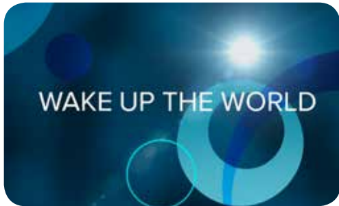
View Archbishop Prendergast’s video message on vocations on our YouTube channel