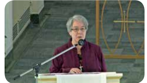
This year's annual celebration of consecrated life was held at Saint Paul University's De Mazenod chapel on January 31.

(Continued from page 1 – The Synod on the family 2015)